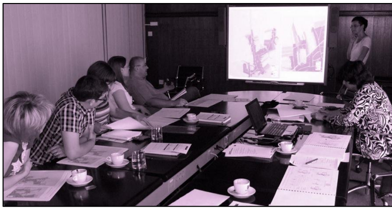
Figure 3.27: The setting of the Ljubljana workshop

As mentioned above, some scenarios were prepared before the actual workshop. The model in its current form can be used to develop interventions but not in real time; in order to ensure the possibility of real-time interventions more programming in a GIS environment is needed. As the evaluation of interventions and development of strategies was not part of the workshop, the different scenarios were shown only as a method to enable better understanding of input and output of the proposed instrument.