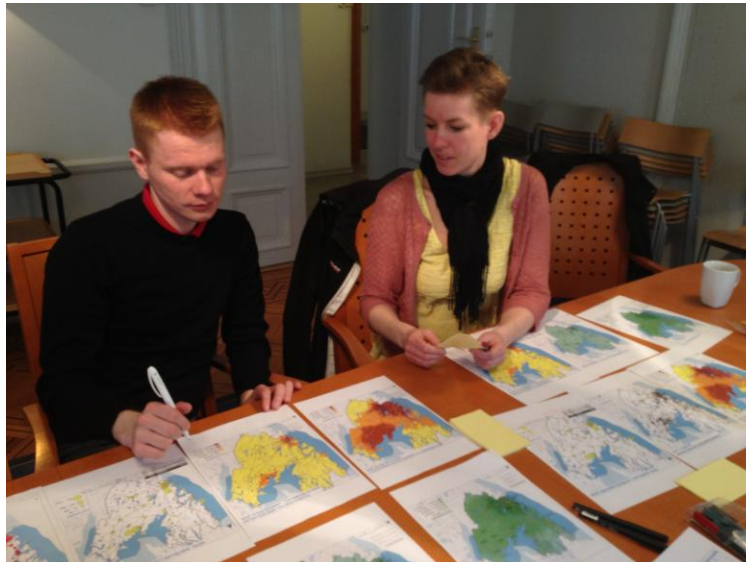
Figure 3.32: Two planners discussing the content of the maps during meeting one

This step was prepared during the first pre-workshop meeting. As the participants already had good knowledge about the instrument, this occasion was used to fill in the pre-workshop survey. In addition, the group started step 1 of the workshop process by discussing a common planning problem. The common planning problem was defined as follows: How can a qualified labour force reach the food sector in Skaraborg via public transport commuting? The instrument used in the case cannot perform online simulations of new infrastructure or timetable modifications. Due to this limitation, the instrument developers produced a number of maps for the first physical meeting based on the outcomes of the pre-meeting.