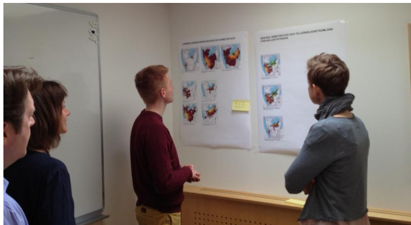
Figure 3.33: All four planners discussing the content of the maps on posters during meeting two

The second workshop started with a presentation of the new maps. One experience from the first meeting was that a large number of paper-maps hindered discussion. The maps and statistics for the second meeting were compiled on four A1-sized posters that were put on the wall, 'forcing' planners and instrument-makers to stand together and discuss. This method proved to have very positive results.