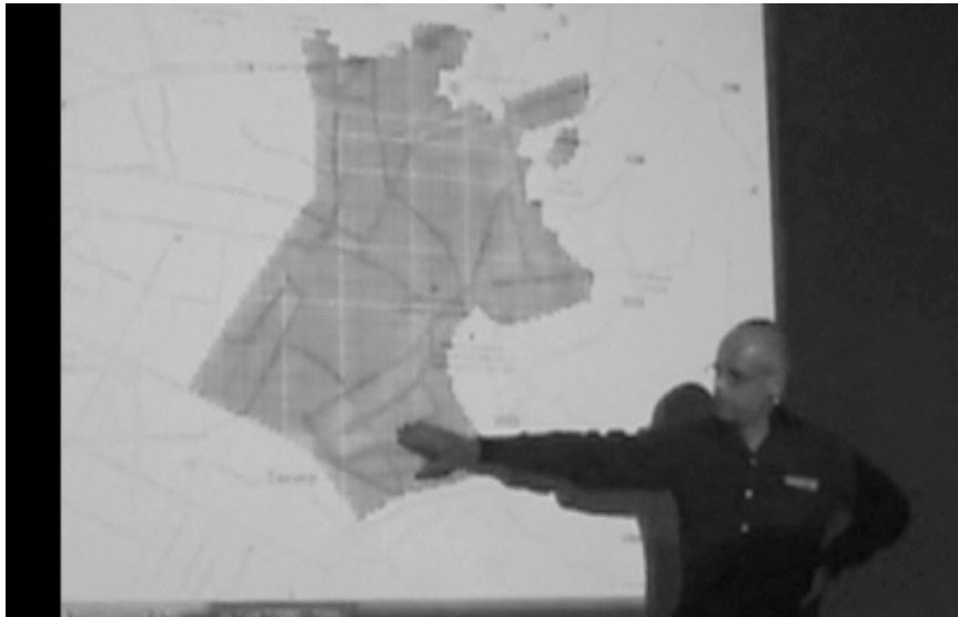
Figure 3.18: Participant with InViTo map