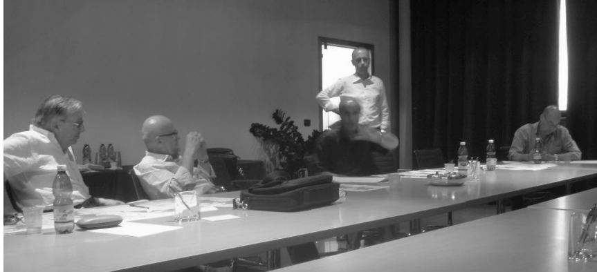
Figure 3.17: The setting of the Turin workshop

During the first hour of the workshop, the WU explained the research, the planning question, the concept of accessibility used to tackle the problem, and the instrument to be used for assessing accessibility. This introduction provided for the sharing of possibilities and limitations given by the InViTo tool in calculating accessibility. The presentation of the tool prompted a discussion on the concept and measures of accessibility (defined in different ways). Most of the participants defined accessibility in terms of time, so that the distance-based setting of the new version of InViTo was seen as incomplete. This step was very useful for thinking about new methods for calculating accessibility, and the participants showed their interest in contributing to the definition of new formulas to be used in InViTo. Since InViTo does not intend to provide numerical responses and is flexible to be adjusted in different ways, the participants accepted the distance-based setting and used the tool.