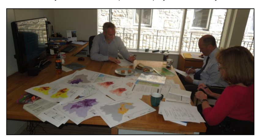
Figure 3.36: The maps used during Edinburgh workshop

In addition, some maps produced by SNAPTA were used to demonstrate the change in accessibility to jobs and retail services that will be brought about by the full construction of the infrastructure improvements of the tram system and Edinburgh South Suburban Railway (ESSR). The maps assisted the discussion about whether the planned transport infrastructures for Edinburgh will lead to better accessibility and reduce the spatial inequity across the city.